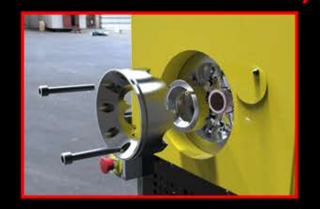
Head tooling can be changed by removing just two bolts, with a full tool change (including mandrel) in under 10 minutes

The touch-screen control panel allows the user to control the machine parameters, check faults,and program and save up to 45 separate parts