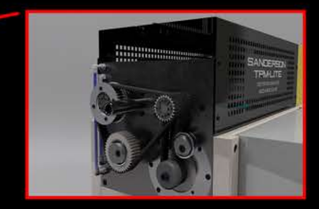
Pulley array on the back of the machine allows for further options to alter linear pitch